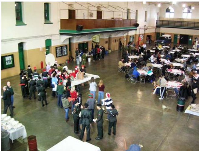
Operation Homeless Dinner underway!