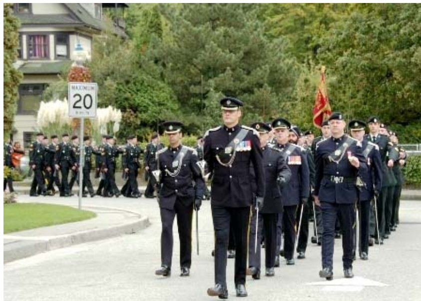
Regiment Marching Past at City Hall.