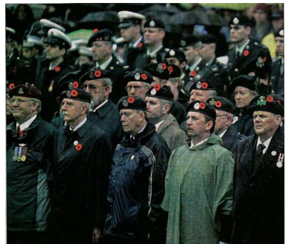
Dukes on Parade at the Cenotaph.