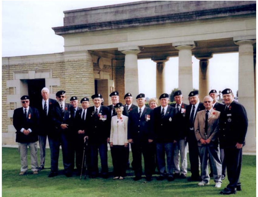
The Tour Group