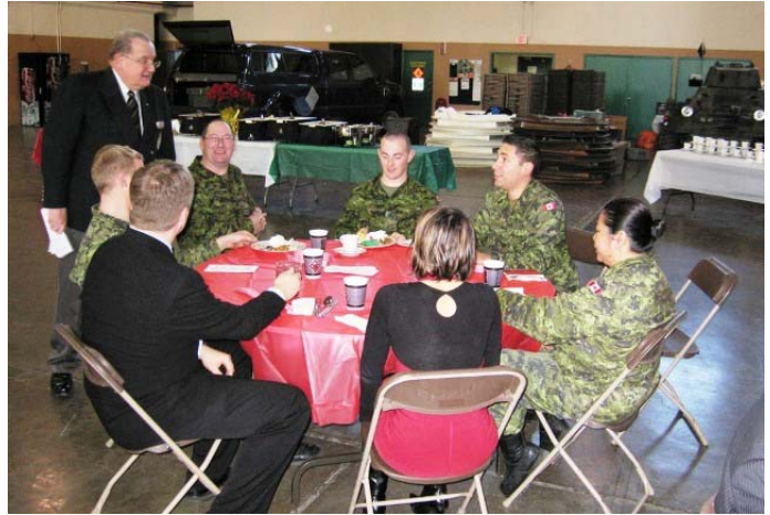
Good Food, Great Prizes and Excellent Company!