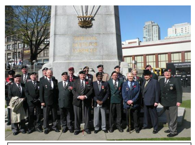
Regimental Association members in attendance at Vancouver First Vimy Day Commemoration Ceremony.

You will be pleased to know that the Vimy Day Commemoration ceremony held at Victory Square at 1100 hrs. on 9 April 2010 was a memorable time for us all. The event was well attended by about 20 members of the Regimental Association and a wreath was placed at the Cenotaph in memory of the Fallen. Many thanks to all who attended on such a fine day!