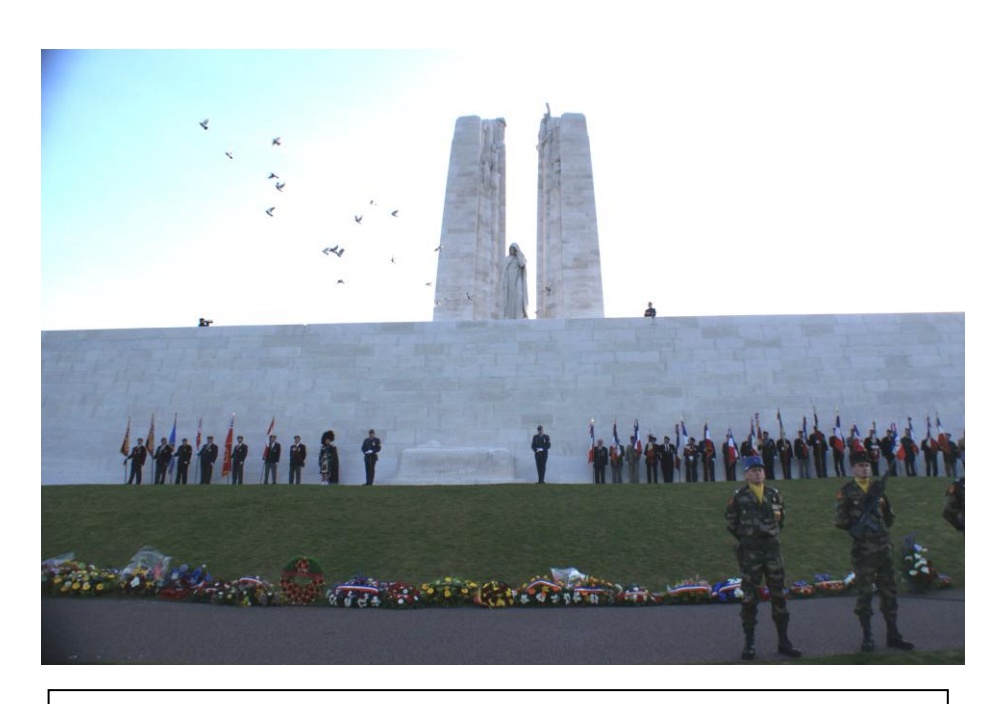
Vimy Ridge Ceremony, 9 April 2010

Thank you so very much, Gauthier, for your excellent service and dedication!