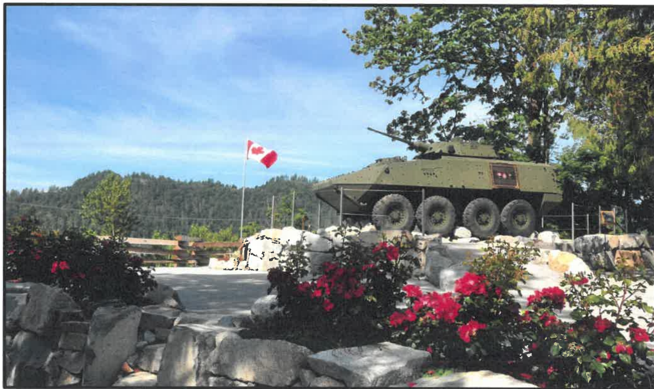
LAV III Monument