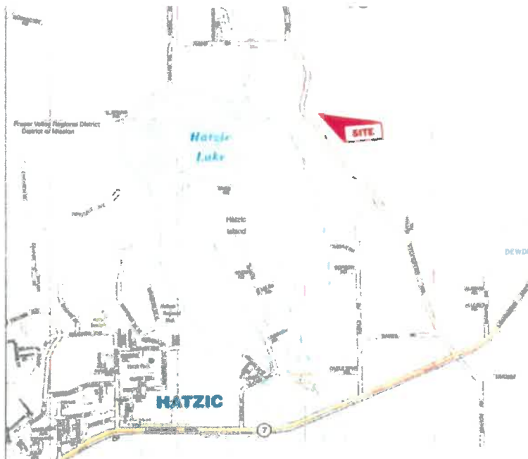
Lougheed Highway (No. 7)

The monument is located at "Shiloh Hill" at 9660 Sylvester Road. Travel 11 kilometers east of Mission City. Turn left on Sylvester Road (Husky gas station on corner). Travel 3 kilometers north. Enter at second gate.